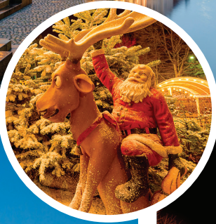
Take a stroll by the city's picture-perfect canals