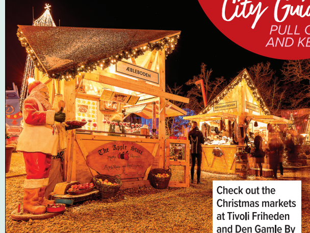
Check out the Christmas markets at Tivoli Friheden and Den Gamle By

From around £37.50 for 24 hours, aarhuscard.com