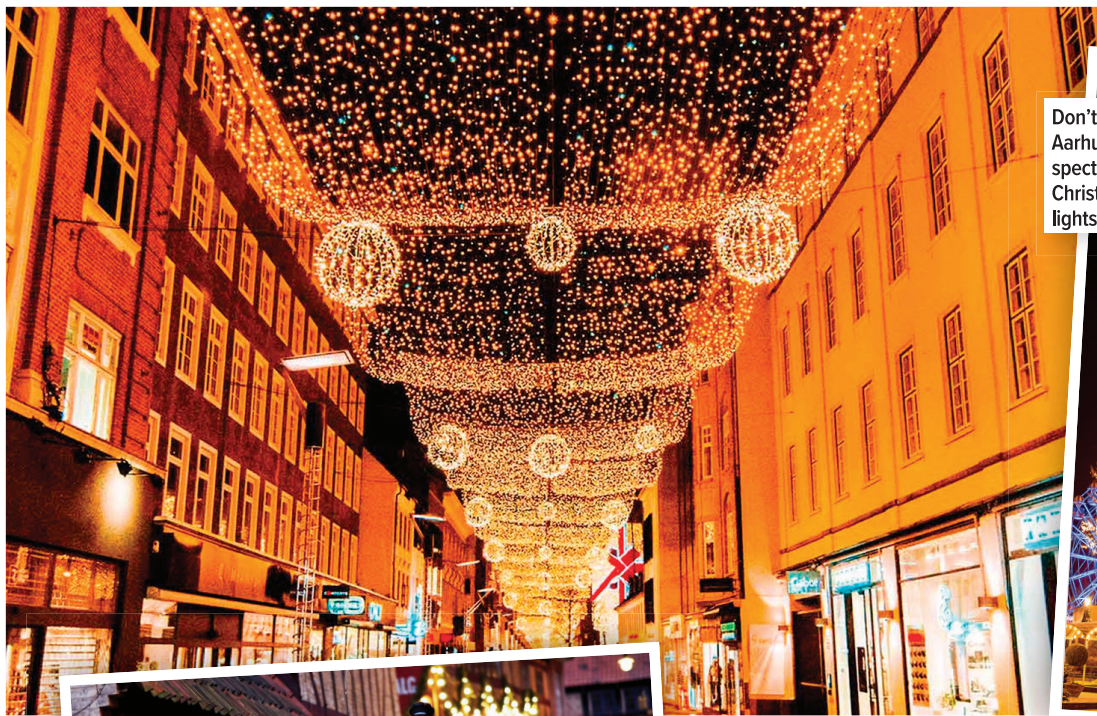
Don't miss Aarhus's spectacular Christmas lights