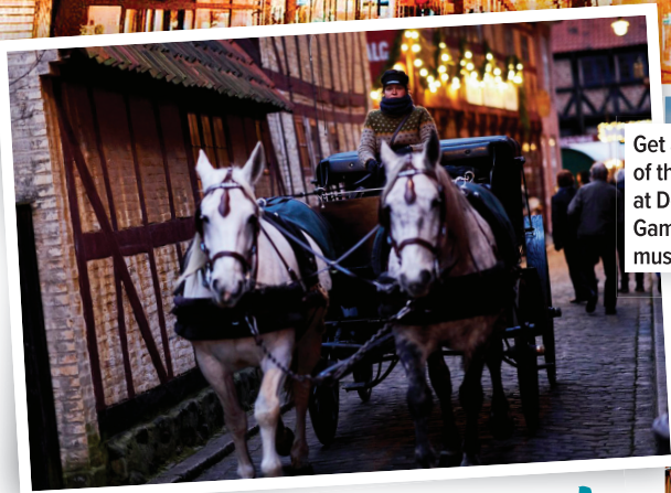
Get a taste of the past at Den Gamle By museum