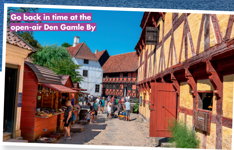
Go back in time at the open-air Den Gamle By

The Aarhus river runs through the charming Latin quarter, which has cobbled streets and painted, timbered houses bordered with hollyhocks.